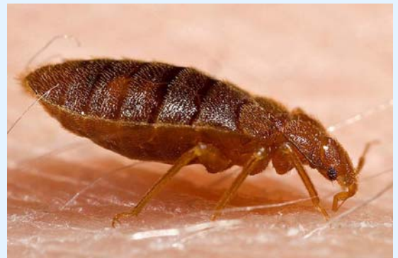
Bed bug images provided by U.S. Centers for Disease Control and Prevention