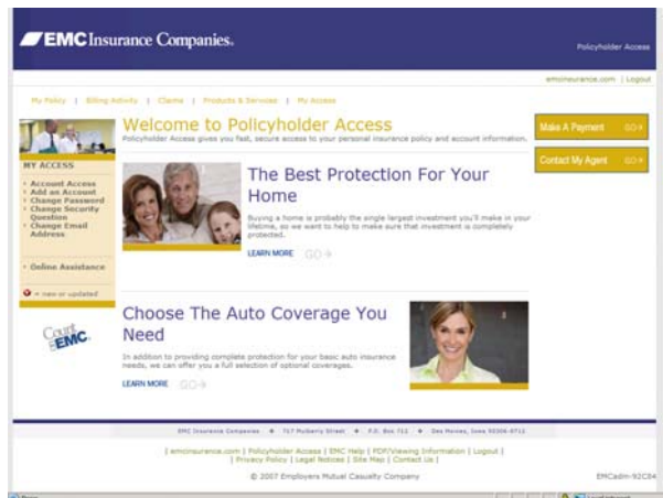
Policyholder Access homepage

A. EMC has a dedicated toll-free number and email address for personal lines policyholders who need help: EMC Online Assistance, 800-988-1423, or OnlineAssistance@emcins.com. Hours are 8 a.m.-4:30 p.m., Monday-Friday (Central time).